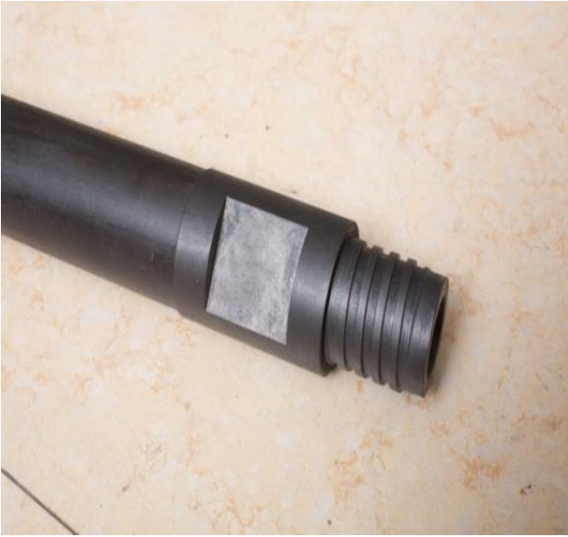
W SERIES CONVENTIONAL DRILL ROD DRILL ROD